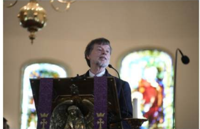
Filmmaker Ken Burns speaks to the audience.