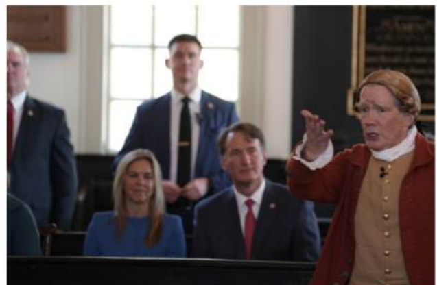
The reenactment of Patrick Henry's famous speech, 250 years later.