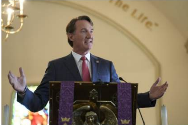
Governor Glenn Youngkin gives his remarks.

250 years later, on March 23, 2025, St. John's Church and VA250 brought history alive with a series of reenactments in the very spot where this pivotal moment unfolded. This program featured keynote addresses from VA250 National Honorary Chair Carly Fiorina and filmmaker Ken Burns, making his first public appearance to promote his newest and highly anticipated documentary PBS documentary series " The American Revolution " premiering November 16, 2025. The event was livestreamed and is now archived on the VA250 website.