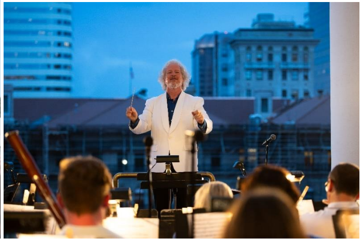
The New Fellowship Gospel Choir and Roanoke Symphony Orchestra performing at the Capitol.