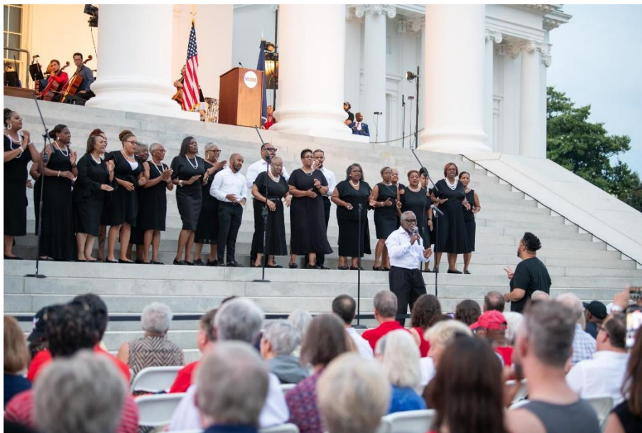
The New Fellowship Gospel Choir performs on the steps of the Capitol.

The afternoon unfolded with a lively Square Fair, highlighting Virginia's unique history and culture. Interactive booths and exhibitions from museums, cultural organizations, and artists brought the spirit of freedom to life. We were thrilled to see so many families enjoying the diverse activities!