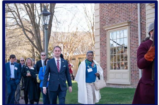
Virginia Attorney General Jason Miyares & Virginia Lt. Governor Winsome Earle-Sears