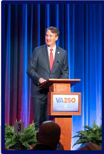
Governor Glenn Youngkin Governor of Virginia