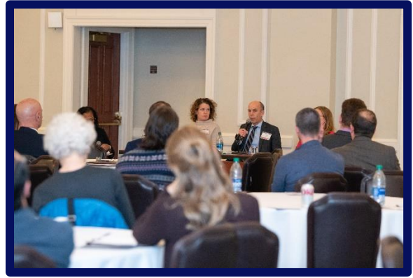
Reaching Teachers and Students in Schools, Providing Impactful Digital and Virtual Content, 2026 National Planning, Public History in Polarized Times, & Funding Your 250th