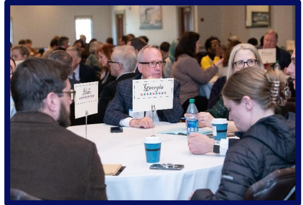
State 250 th Planners