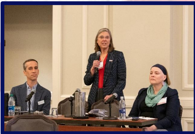
Local VA250 Committees