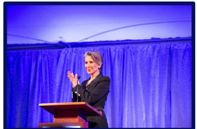
Carly Fiorina, VA250 National Honorary Chair Chair, Colonial Williamsburg Foundation