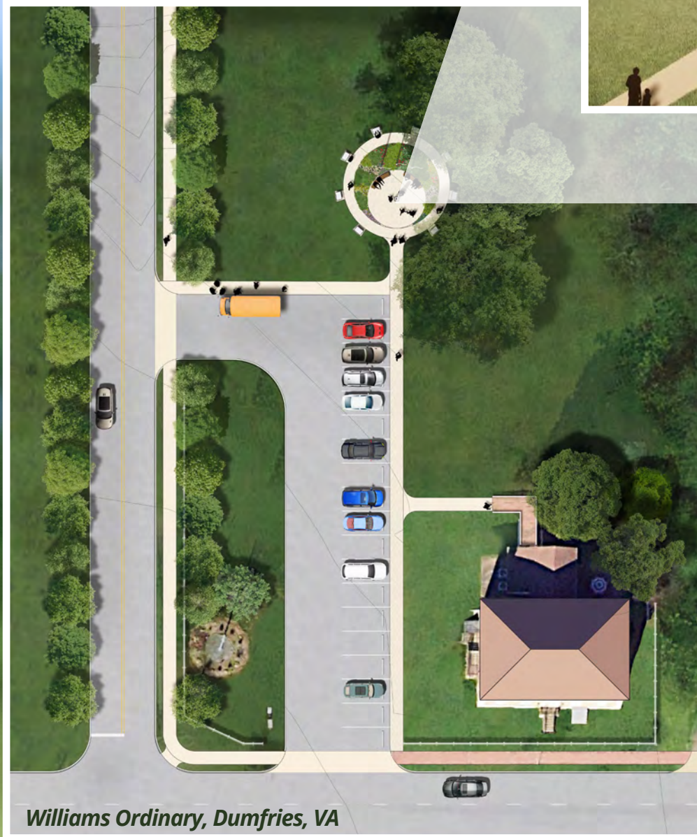
Williams Ordinary, Dumfries, VA