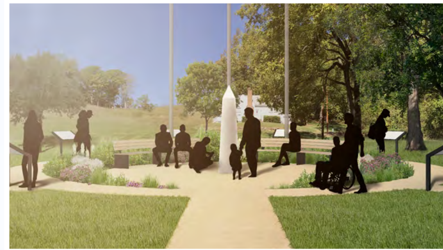
The memorial will be a simple inscribed stone, with a landscaped plaza surrounding it. Included in the plaza will be interpretive markers providing a historical overview of Prince William County's role in the American Revolution.