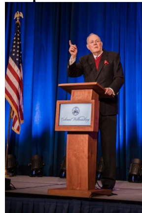
Justice Anthony Kennedy United States Supreme Court Justice, Retired