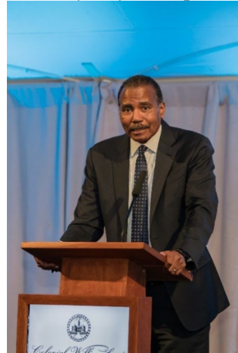
Bill Whitaker 60 Minutes Correspondent