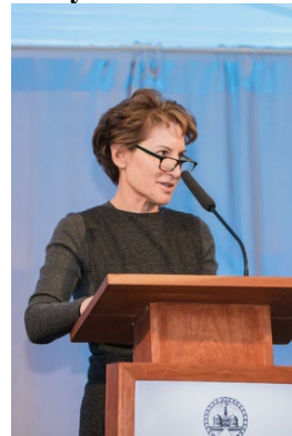
Stacy Schiff, Pulitzer Prize-winning Author