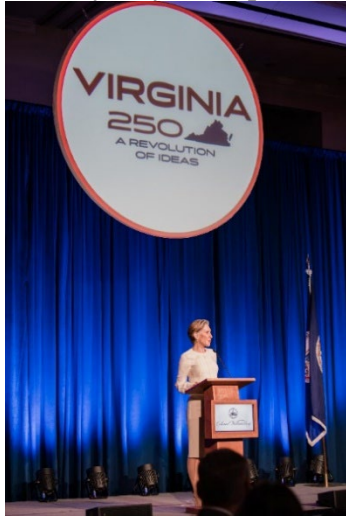
Carly Fiorina, Chair The Colonial Williamsburg Foundation